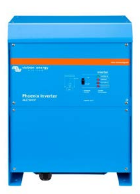
Phoenix Inverter 24/5000