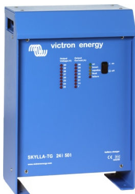
Skylla Charger 24 V 50 A