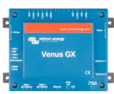
Venus GX The Venus GX provides intuitive control and monitoring. It has the same functionality as the Color Control GX, with a few extras: - lower cost, mainly because it has no display or buttons - 3 tank sender inputs - 2 temperature inputs