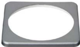
BMV bezel square