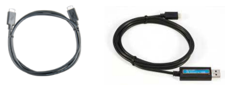
Interface cables - VE.Direct cables to connect a BMV 712 to the Color Control (ASS030530xxx) - VE.Direct to USB interface (ASS030530000) to connect several BMV 70x to the Color Control or to a computer.