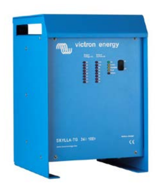
Skylla TG 24 100