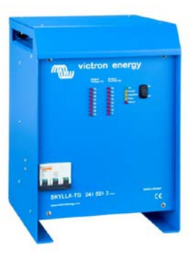
Skylla TG 24 50 3 phase