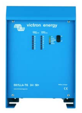
Skylla TG 24 50