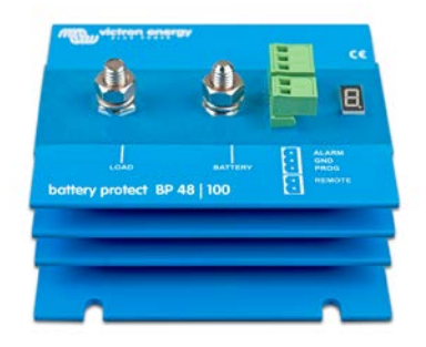
BatteryProtect BP 48-100