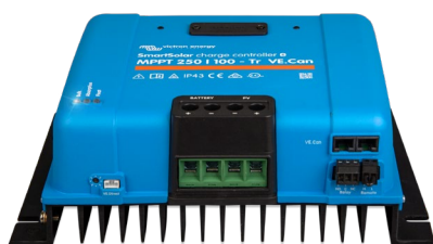
SmartSolar Charge Controller MPPT 250/100-Tr VE.Can without display