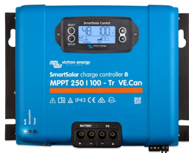
SmartSolar Charge Controller MPPT 250/100-Tr VE.Can with optional pluggable display