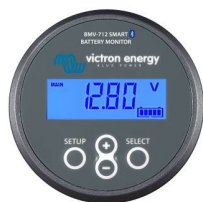
Bluetooth sensing: BMV-712 Smart Battery Monitor